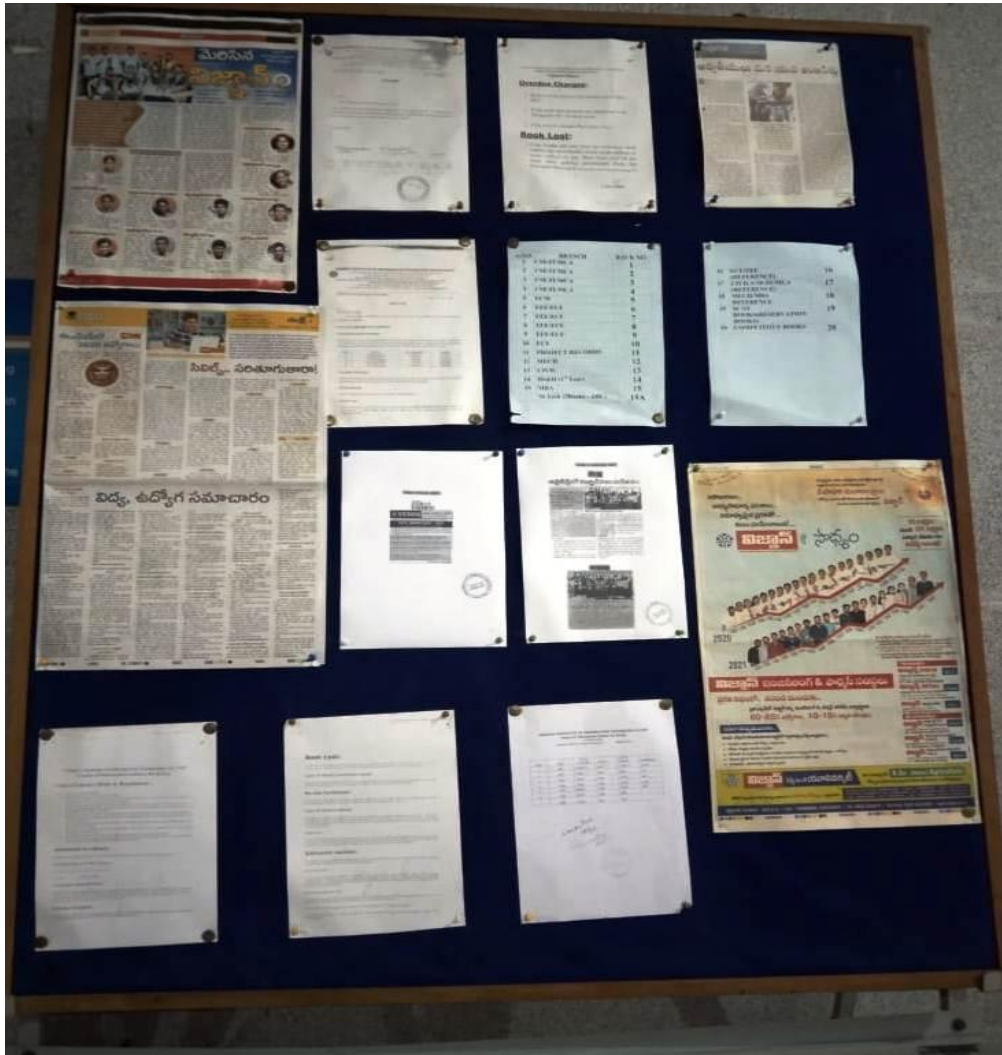
Information deployment and notification

(Approved by AICTE-New Delhi, Affiliated to JNTUK, Kakinada) Beside VSEZ, Duvvada, Vadlapudi Post, Gajuwaka, Visakhapatnam - 530 049.